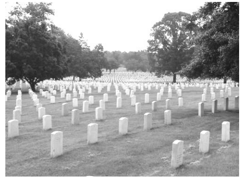
Paying respects - Arlington National Cemetery