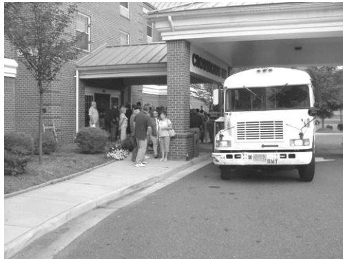
Tour transportation was provided by the United States Marine Corps

Base tours included the Marine Corps University Library and Archives, the Basic School, the Martial Arts Center for Excellence, HMX-1 - the President's helicopter squadron and the Marine Corps Association's publication center and book store.