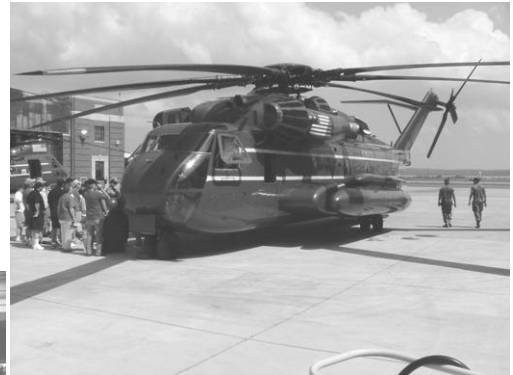
Visiting HMX-1, the President's Helicopter Squadron

Marine Barracks (8 th & 'I') and then spent the evening watching the famous silent drill team and listening to the Marine Corps Band.