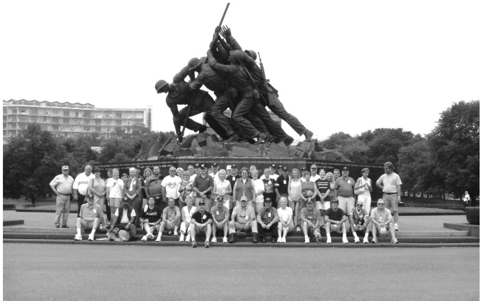
11 th Engineer Battalion at the Marine Corps War Memorial, Arlington Cemetery

In addition to touring many of the facilities housed on the Quantico Marine base, major memorials in Washington, DC were visited and an evening with the Commandant of the Marine Corps at the Marine Barracks (Eighth and 'I") was enjoyed by all.